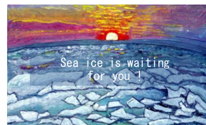
Sea ice at Mombetsu by Takao Nakajin